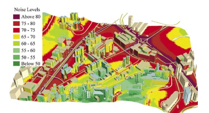
Figure 2. Noise model in 3D for impact assessment of road traffic noise (Db) in Kwai Chung new town, Hong Kong. Noise levels shown in the model are for indicative purpose and do not relate to actual traffic noise levels on site (Source: Environmental Protection Department, Hong Kong SAR).

spatial resolution of current hyperspectral sensors. Developments in terrestrial based mobile mapping, making use of GPS and inertial navigation systems with image capture, have proved very effective for inventorying urban facilities and infrastructure such as street lights, traffic lights, railings and road signs. In Hong Kong, the Highways Department surveys road surface condition and street furniture by field observation, but The Leador Mobile Mapping System (www.leador.com.cn) has been collecting data for many Chinese cities.